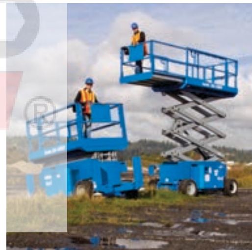
The GS-69 RT models feature a 1.52 m (5 ft) extension deck when equipped with outriggers.

The Genie GS™-4069 RT is the world's first 12.12 m (39 ft 9 in) full drive height rough terrain scissor lift in its class. The GS-2669 and the GS-3369 RT models are also equipped with this feature, providing ultimate end user 'up time' while on the jobsite.