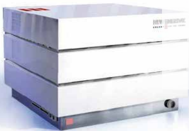
Indoor ready enclosure