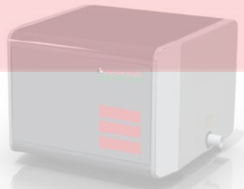
Outdoor ready enclosure